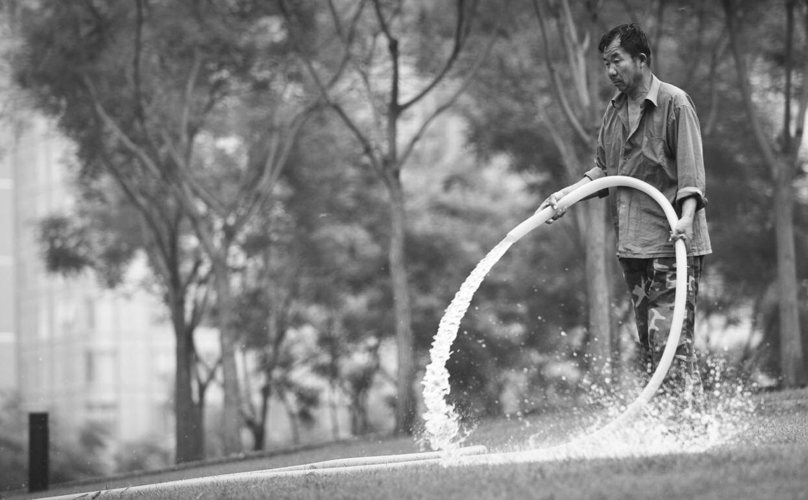
A worker waters a lawn in a residential compound in Beijing on June 27, 2008. Beijing's water crisis is so critical that the city is facing economic collapse and will need to resettle part of its population in coming decades, according to various experts.

affected more than 20 villages downstream along the river to varying degrees. Losing irrigation for maize caused a yield reduction of 21 percent, and had a more striking impact on rice and vegetables, as they were phased out due to lack of irrigation water. No compensation was provided following this intervention. Many farmers interviewed complained about unfair treatment and the lack of equity in this matter. Based on our estimation, the appropriate level of compensation should be around 227 RMB/mu per year for the loss of irrigation. Former paddy rice land should be compensated more due to greater income loss in converting rice to dryland crops.