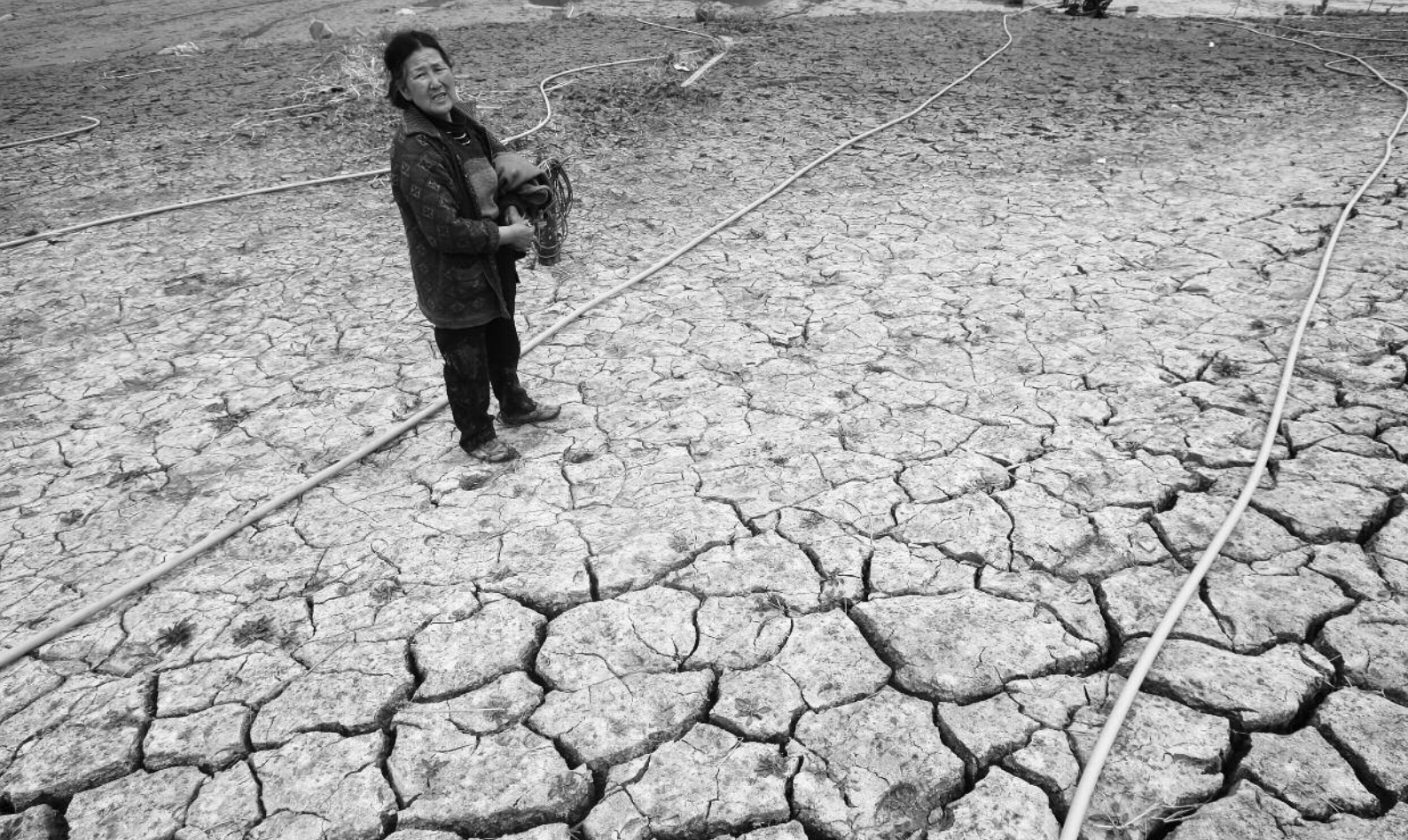
A rural woman watches the pipes which are used to pump water from an almost dry reservoir.