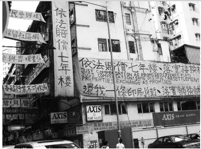
Banners on Lee Tung Street