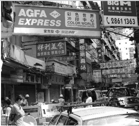
Wedding Card Street before demolition