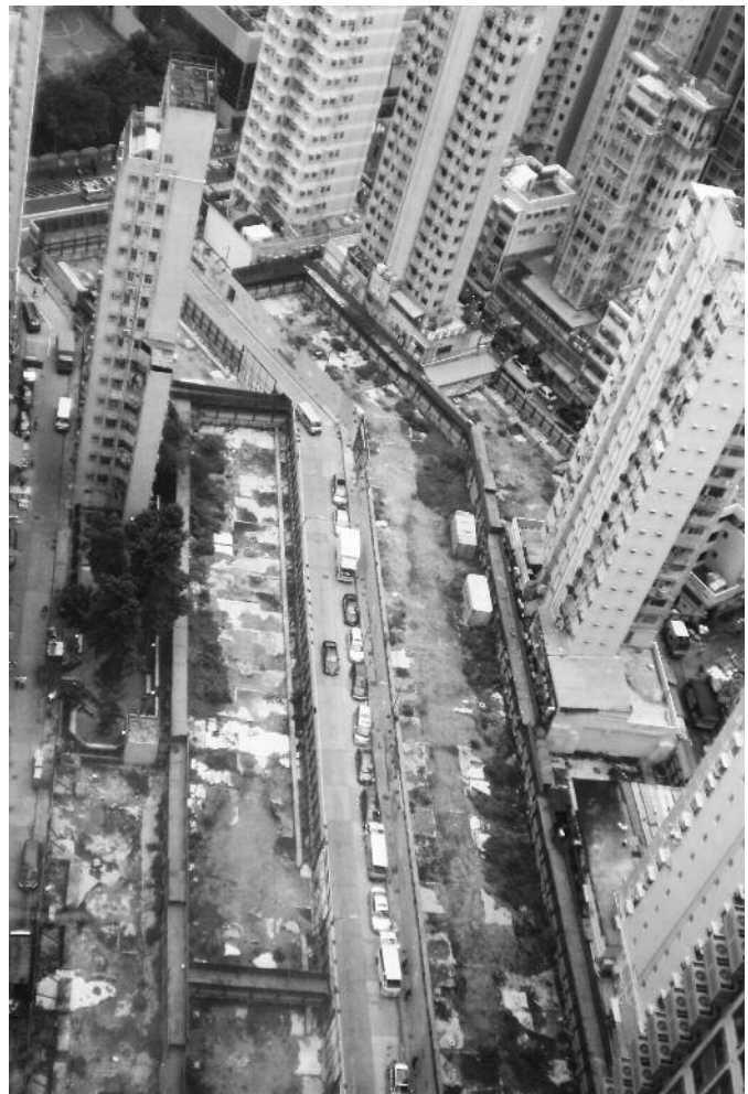
Lee Tung Street today

The market controversy raised residents' awareness, and they began to mobilise against the development model the government was imposing via the URA, which had unveiled numerous redevelopment projects in Wan Chai, especially around Johnston Road. Of course, the area was run down and located close to business hubs, with attendant economic pressure to develop and transform it, as well as to raise the standards of local residents.