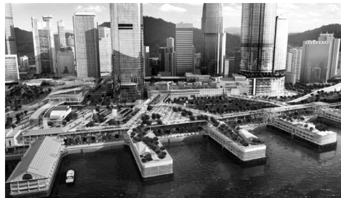
View of projects in front of IFC

Source: Central Waterfront Project Management Company Limited