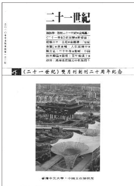
Ershiyi Shiji celebrates its 20th anniversary, October 2010.