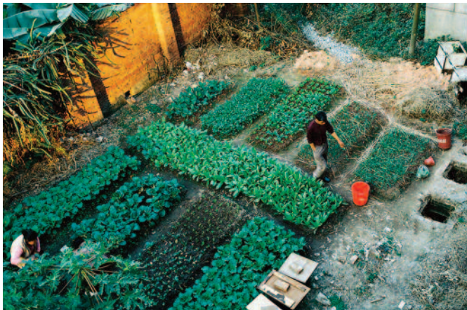
Plots of land