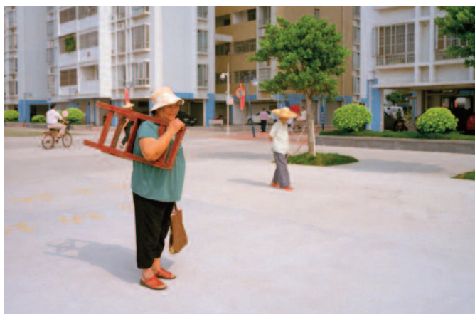
An inhabitant standing in front of the new blocks