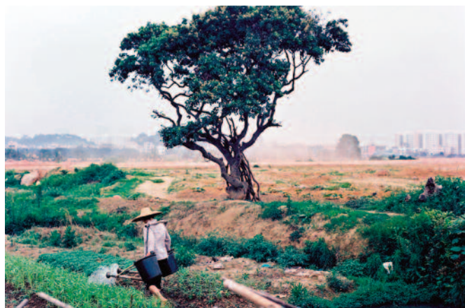
Picture of wasteland

The people most committed or able to take a stand were progressively isolated, while others became afraid or simply did not know how to pursue resistance any further. One of them commented: "We were confronted with