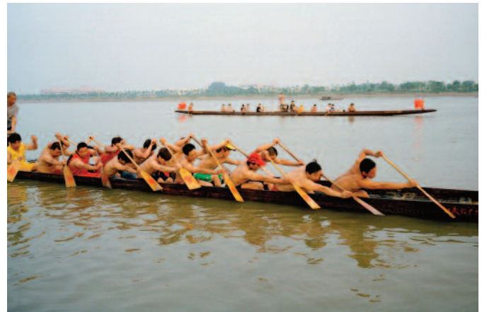
Dragon Boat departure