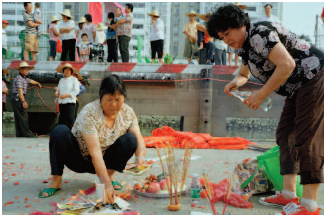
Ceremony in front of a block of flats