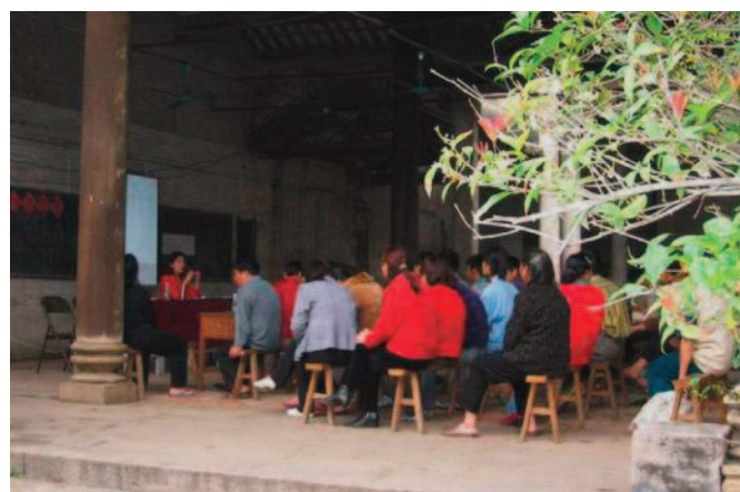
A meeting in the temple

In October 2005, two months after the arrival of the Task Force, new elections were held in the village, but only the former members of the village committee were allowed to present themselves, and members of the security forces intimidated the village representatives, (42) designating the "pre-