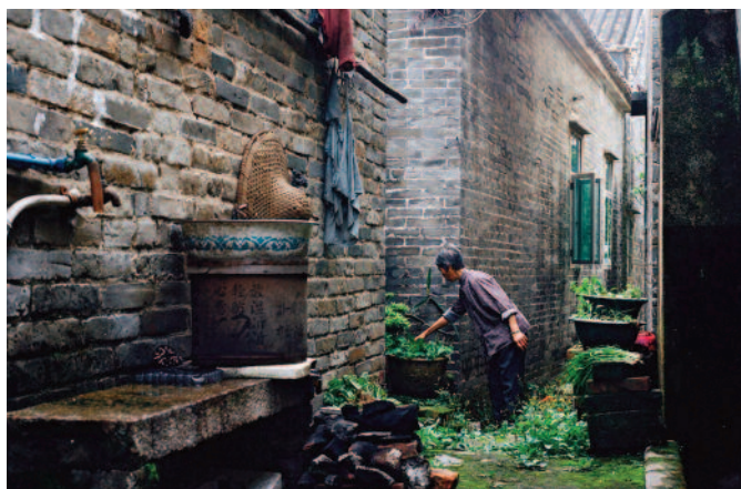
A woman in one of the village streets