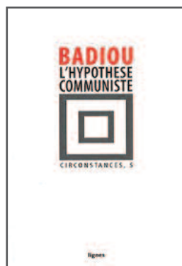
Alain Badiou, L'Hypothèse communiste (The Communist hypothesis), Paris, Nouvelles Éditions Lignes, 2009, 192 pp.