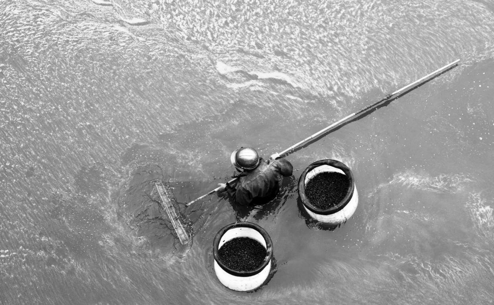
A man collects snails from the algae-infested Taihu lake

reforms carried out in the late 1990s have left many people with average and modest incomes in a precarious situation. These multiple problems have fuelled many social movements, which have spread at a disquieting rate in recent years. In July 2005, Zhou Yongkang, then public security