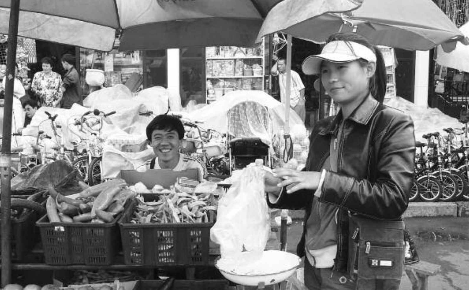
The Chinese market in Irkutsk, 2005: Chinese farmers selling vegetables they grew in Russia.