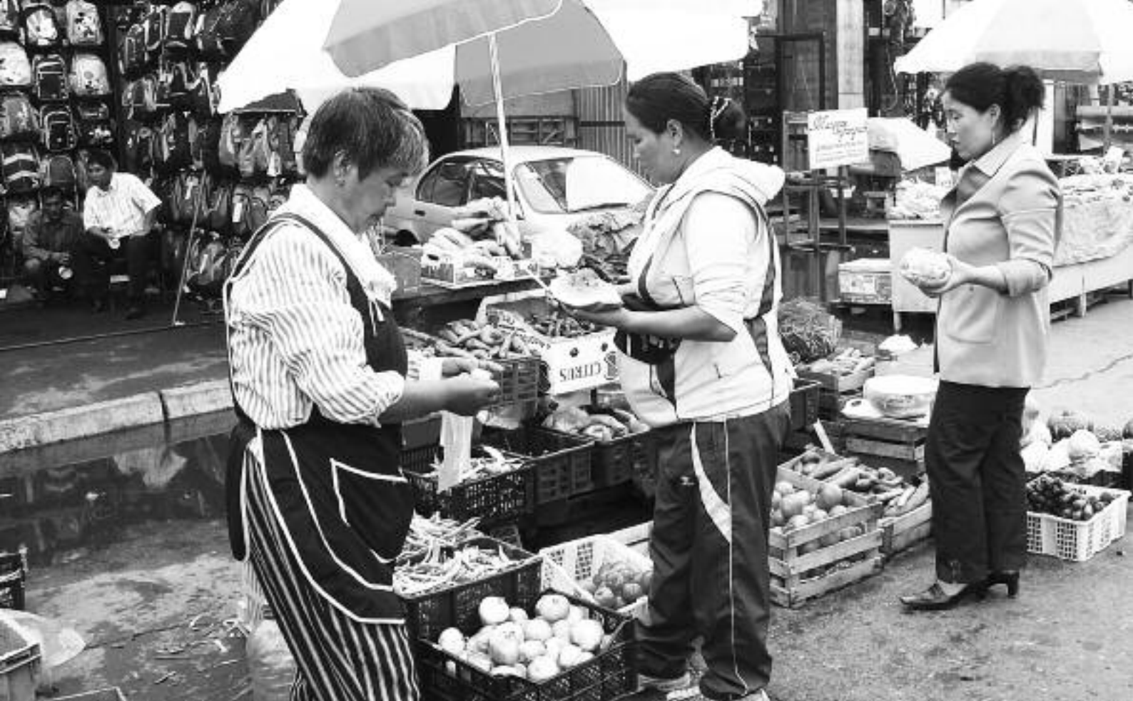
Selling vegetables cultivated in Russia and imported Chinese fruit in the Chinese market in Irkutsk in 2005.