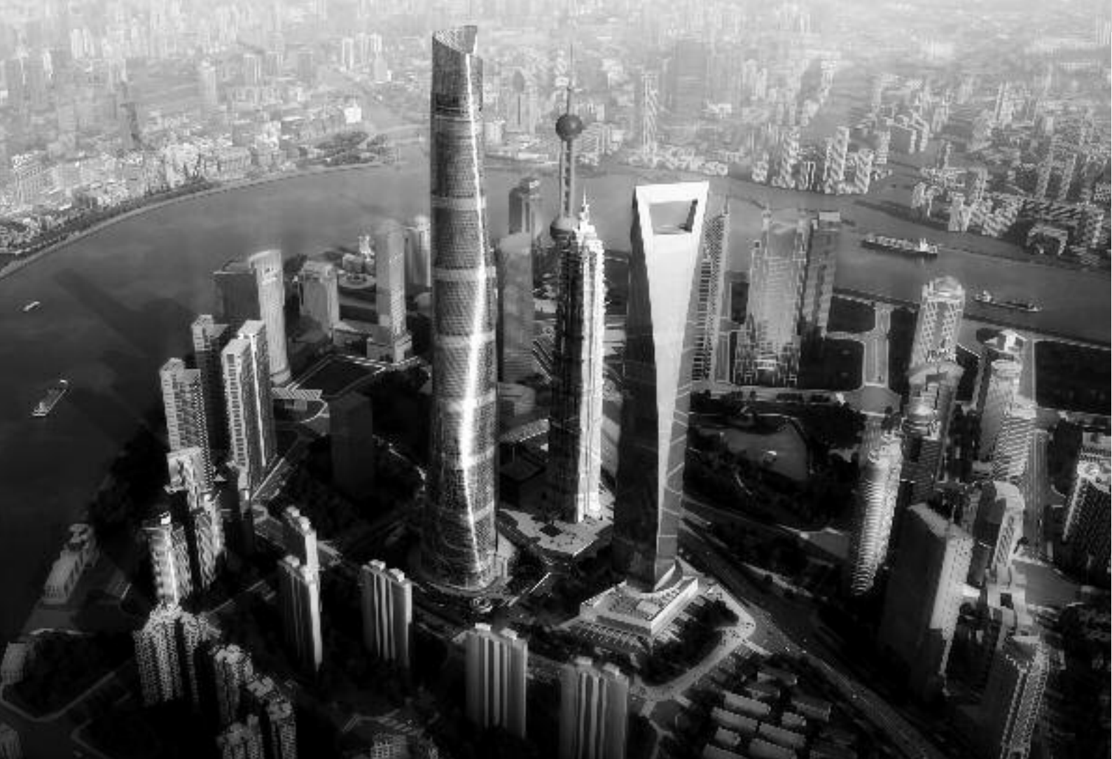
Artist's impression of Pudong district in 2014 following the construction of the "Shanghai Tower."