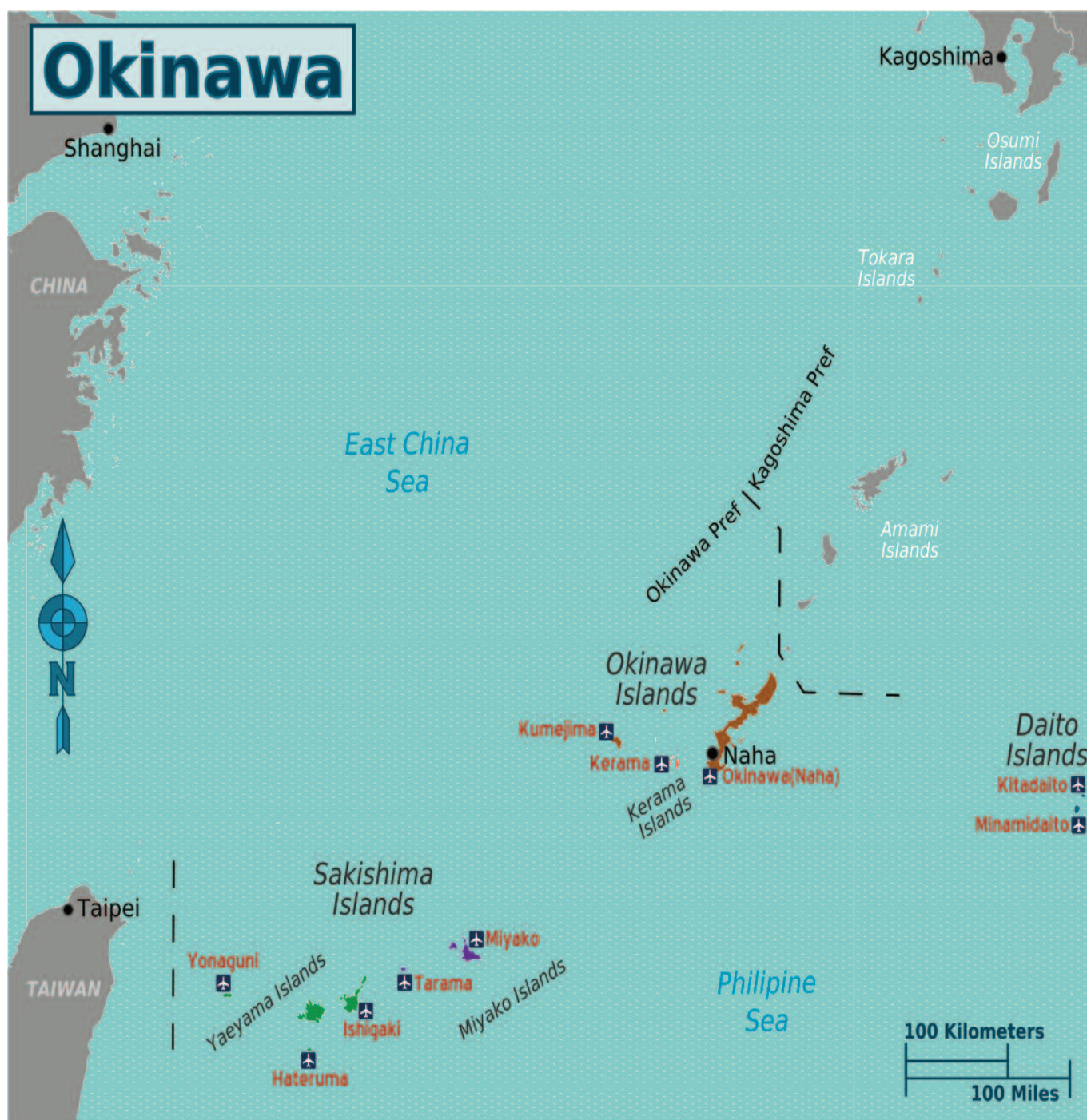
Map of Okinawa and Sakashimi Islands.

Wikitravel, http://wikitravel.org/shared/Image:Japan_Okinawa_map.png (consulted on 30 November 2011).