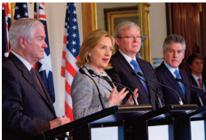
U.S. Secretary of State Hillary Rodham Clinton, second from left, speaks as U.S. Secretary of Defence Robert Gates, left, Australian Foreign Affairs Minister Kevin Rudd, second from right, and Australian Defence Minister Stephen Smith look on during a press conference after the annual Australia-United States Ministerial Consultations (AUSMIN) at Government House in Melbourne, Australia, on 8 November 2010.