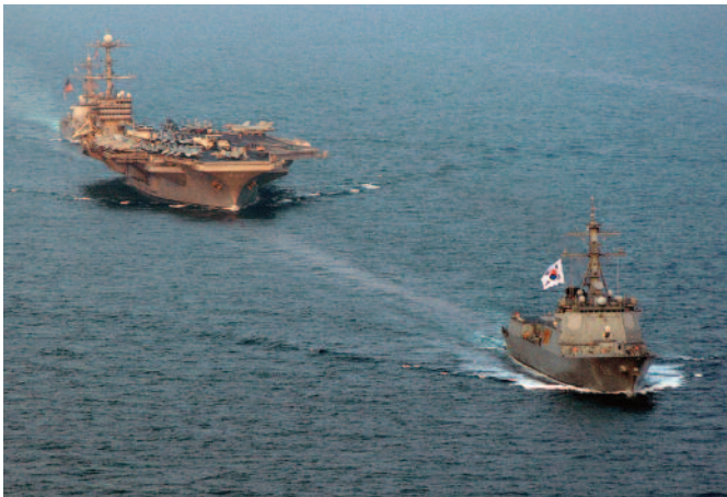
The aircraft carrier USS George Washington (CVN 73) and the Republic of Korea navy Aegis destroyer Sejong the Great (DDG KDX 991) transit in the Yellow Sea during a bilateral exercise on 13 October 2009. George Washington, the Navy's only permanently forward deployed aircraft carrier, is underway supporting security and stability in the region.