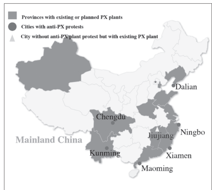
Map 1 – The recent anti-PX protests in China

While many observers have hailed the activism of the urban middle class as the birth of China's environmental consciousness, many have overlooked the PX dispute in Jiujiang, Jiangxi Province. Since the Jiujiang municipal gov-