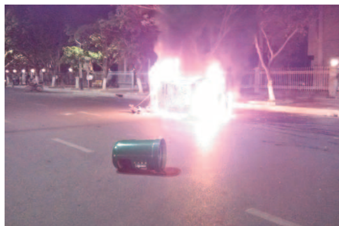
Photos 4 and 5 – Burned vehicles in Maoming, 30 March 2014.

I believe the PX project is good for the economic development of Maoming, but will it provide employment opportunities for us? The GDP of Maoming ranks among the top contributors to Guangdong Province, but why is per capita income still so low? Obviously the city is wealthy and strong, but the people are poor and weak. Moreover, there are already two time bombs, the ethylene plant and the oil refinery, in Maoming. Can people survive if a PX plant is built this year? An explosion occurred in the ethylene plant in 2008, and as a result, well water in the nearby villages became black and undrinkable. Such pollution incidents happen frequently in Maoming. Every time it is rainy and windy, we can smell the stench of the oil refinery. Living here is simply slow-motion suicide. The special local product here is no longer lychees and longan fruit, but rather nasal inflammation. (A retired worker, April 4 2014)