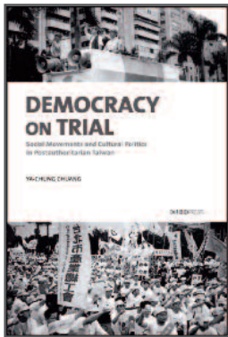
Ya-Chung Chuang, Democracy on Trial: Social movements and cultural politics in postauthoritarian Taiwan, Hong Kong, CUHK Press, 2013, 269 pp.